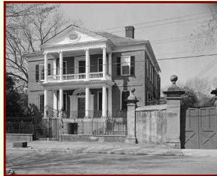
The Branford-Horry House (above) is one of Charleston's finest examples of a three-story brick Georgian double house. The street façade was altered in 1831-34 when two-story Regency style porches were added. (ca. 1765-67)